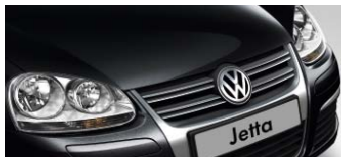
Deep Black Pearl effect paint 2T