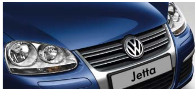
Shadow Blue Metallic paint P6