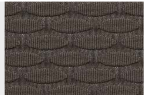
Titanschwarz Comfortline "Vienna" leather upholstery TW