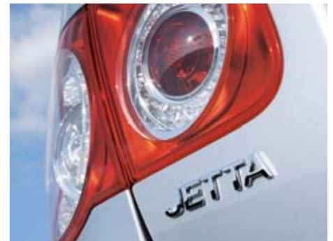
To make it a class above the rest, the Jetta comes complete with LED tail lights.