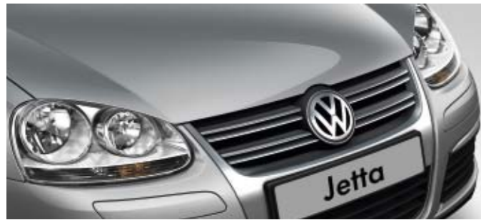
Reflex Silver Metallic paint E8