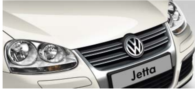
Candy White Solid paint B4

The intricate painting process applied by Volkswagen complies with the very highest requirements. Galvanisation provides reliable protection against corrosion. This gives the best possible protection against oxidation during the vehicle's entire lifetime - with a thickness of less than 20 millionths of a millimetre.