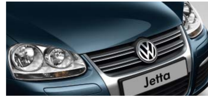
Blue Graphite Pearl effect paint W9