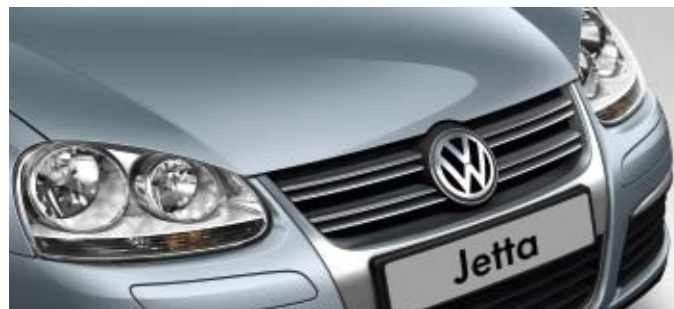
Heaven Blue Metallic paint R2