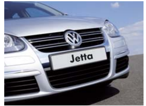
Chrome-plated radiator grille surround and louvres.

The interior fulfils the promise of the Jetta's impressive exterior. The easy-care "Vienna" leather upholstery creates an exclusive ambience and provides enhanced sitting comfort (Comfortline). All displays and functions have a driver-oriented, user-friendly layout and perfected ergonomics. The chrome-plated gear knob surround and handbrake button introduce a level of refinement indicative of Volkswagen's first-rate build quality throughout.