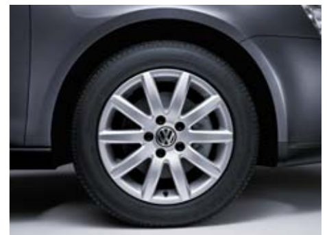
16-inch "Toronto" alloy wheels